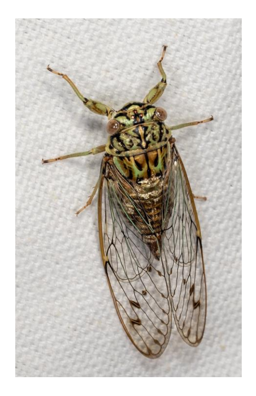
There are at least 19 cicada species in Florida. One of the most attractive is the Hieroglyphic Cicada.

iNaturalist logs all observations into a huge international database and is a great tool for organizing and sorting your data. Our friend of SCC Audubon, Clint Gibson, created an iNaturalist "project" for us called "Sun City Center Nature Trails" if you enter that into the search field of the iNat home page, you will see all the observations and ID's that have been uploaded just from the Trails. You will be impressed with the number of moths and other nocturnal fliers that were recently added. Five of us did a night survey at the Trails in mid-September and were delighted at the sheer numbers and diversity of the insects that showed up. But that is a topic for another column! Meanwhile, enjoy these few samples of images from that night.