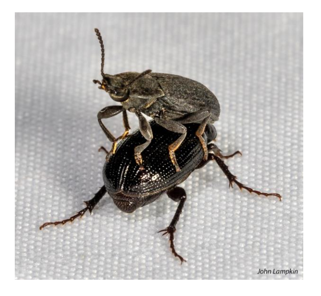
"Wow, I wonder what our children will look like!" A darkling beetle takes a ride on a scarab.

Do you want to be a naturalist? It's easy and fun! iNaturalist is an app that allows you to take a picture of any plant or animal with your phone and upload it. Almost instantaneously, your subject will be identified to species or at least a general category. For more information and tutorials about downloading and using the app, visit iNaturalist.org/pages/getting+started